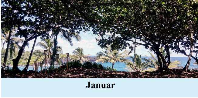
(a) Top view